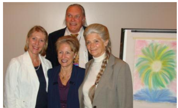
Wednesday Evening was the North American Mediums turn (left).